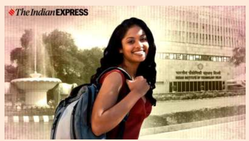
IIT Madras topped NIRF ranking but was not featured in international rankings at all.

IITs blame the high weightage given to 'perspective' metrics, which they claim lack transparency. The HRD Minister also said that he does not agree with international rankings and will instead focus on making Indian ranking a dream for international institutes.