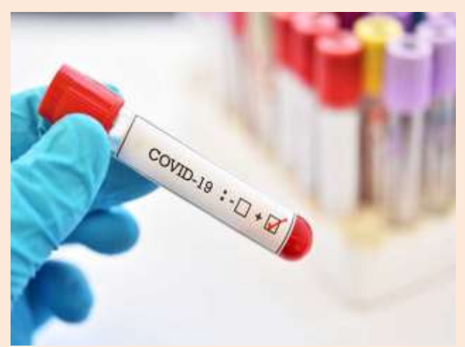
IIT Delhi, NCL working on home-based testing kits for Covid

IIT Delhi and National Chemical Laboratory, Pune are working on easier and quick testing methods including a home based testing kit for COVID19 which can be administered by the user himself at home.